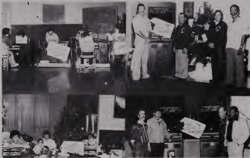
HOLIDAY SPIRIT — The Veterans Administration Hospitals and a variety of children's hospitals were among the many organizations to receive a special Christmas gift from Atari — coin-video games. The company donated over 400 "free-play" games to San Francisco Bay Area and Baltimore, Md. charities. San Francisco Bay Area charities included the Menlo Park (upper right) and Palo Alto (lower right) chapters of the Veterans Administration hospitals; The Chandler Tripp School for orthopedically handicapped children in San Jose (upper left) and the Shriners Hospital for Crippled Children in San Francisco (lower left).